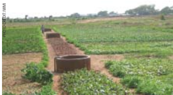
Intermediate water storage supports pathogen die-off

Secure land tenure encourages farmers to invest in mitigation measures at the farm level. A majority of urban and peri-urban farmers in many countries occupy/squat on public lands or are tenants on land owned by others and have no tenure security. Where policy reforms can provide greater (formal or informal) tenure security, farmers are more likely to invest labour and capital in irrigation infrastructure, such as drip or furrow irrigation, which reduce crop contact with wastewater. Improved tenure contracts would allow for such investments, while credit